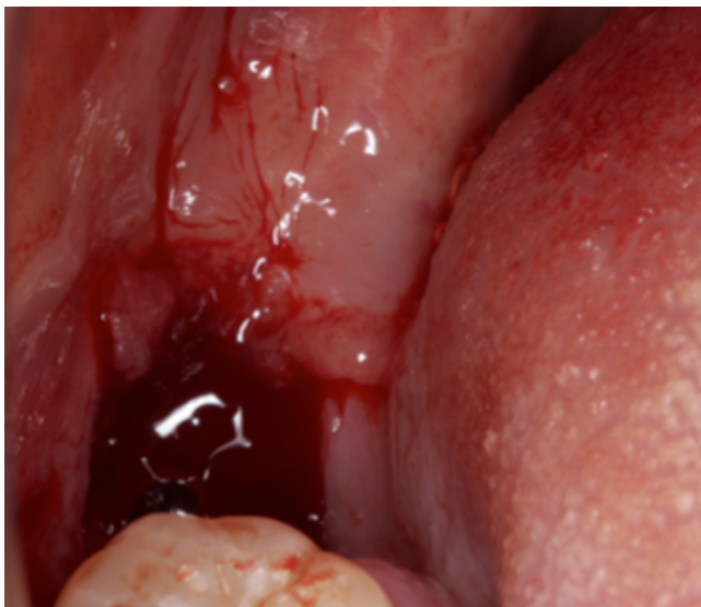
Fig 2 Generalised “ooze” from a lower wisdom tooth socket