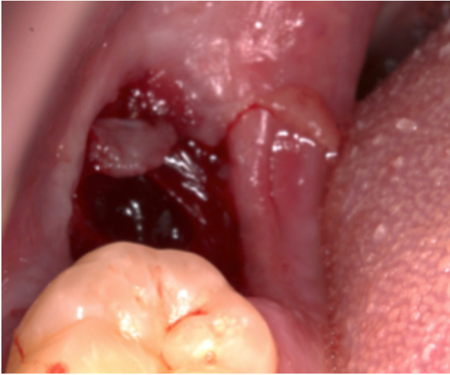
Fig 3 Established haemostasis in a lower wisdom tooth socket